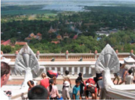
Oodong Mountain temple vista