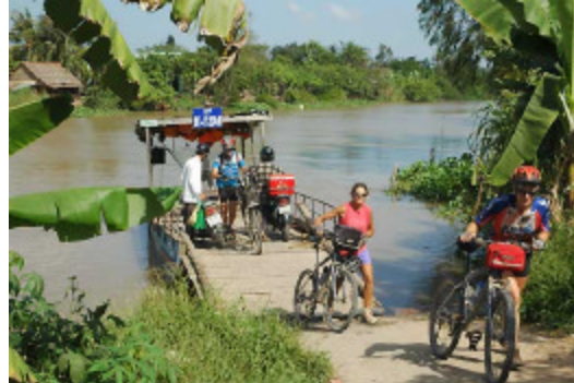
a typical Mekong delta ferry