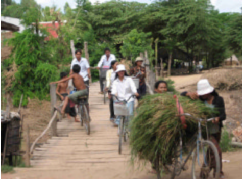
crowded bridge, grass man with bike