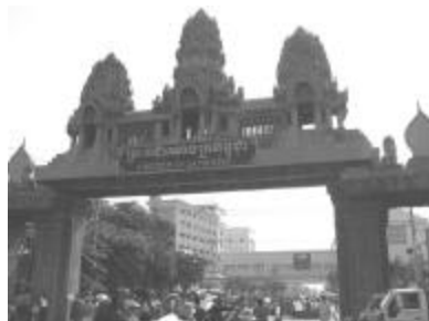
. Kingdom of Cambodia gate