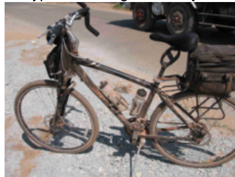
Bruce's hybrid, broke and dirty