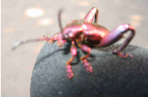
"How long's that bug been on my saddle?"