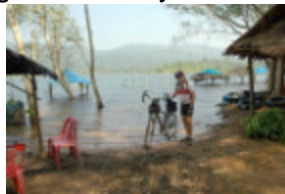
good place to clean my bike?