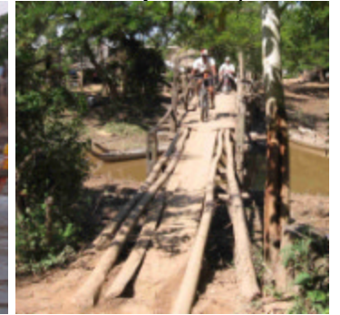
love those narrow bridges