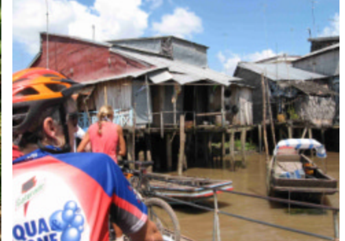
stilted Vietnamese river homes