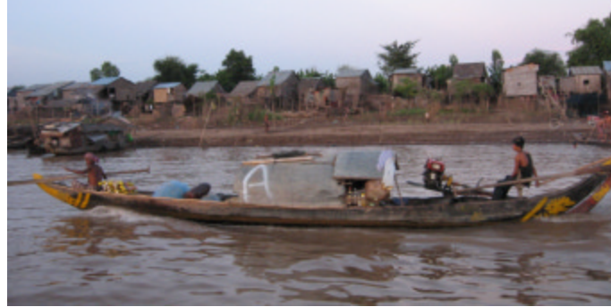
a long fishing boat cruises by stilted homes on shore