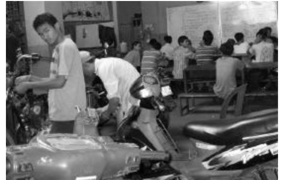
motor scooter repair class

in small villages on back roads, hiking up Oodong Mountain for more temples and grand vistas. On day ten, after a day of agrarian back roads, we reached the large urban area of Phnom Penh, capital of Cambodia and no place to enjoy biking. On the following rest day we went to another of the charities, a school for street kids – elementary and vocational. A vignette: Four mendicant monks in bright orange robes were soliciting offerings. We weren't carrying much cash at the time, but they accepted a few Power Bars and offered blessings for a safe journey.