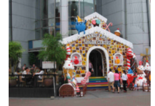
Candy Land at Saigon Centre