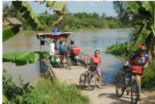
a typical Mekong delta ferry