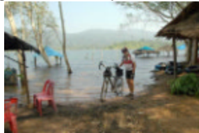
good place to clean my bike?