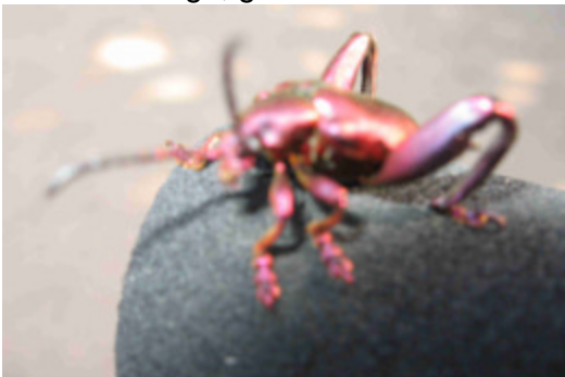
"How long's that bug been on my saddle?"