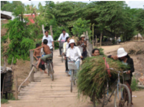
crowded bridge, grass man with bike