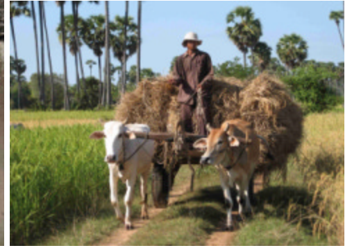
"Okay, I'll step aside"