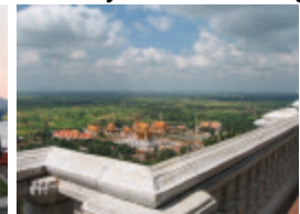
Oodong Mountain temples