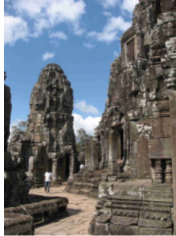
Angkor Wat temples