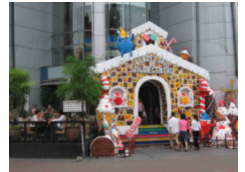
Candy Land at Saigon Centre