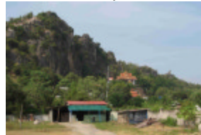
far east West Virginia