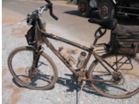
Bruce's hybrid, broke and dirty