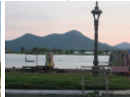
Tonle Sap at Siem Reap