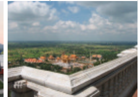
Oodong Mountain temples