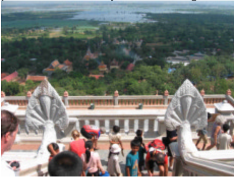
Oodong Mountain temple vista