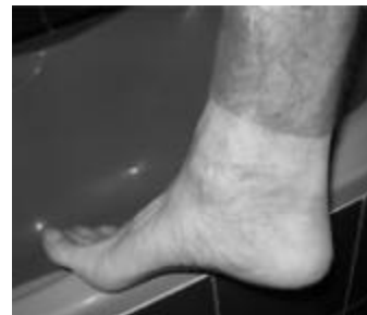
"tan" lines of dirt

We crossed into Cambodia without incident on day five at a major commercial check point, and moved to the right side of the road for the rest of our tour. Chris routed us quickly onto unpaved by-ways through small communities where we were the excitement of the day. Much of the next day was along a very dusty road with more traffic than one might enjoy, and we washed a lot of red dust down the drain in nice bathrooms that afternoon in Siem Reap, before an evening of traditional performances by one of the groups we were supporting.