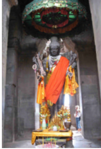
a god at Angkor Wat