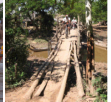
love those narrow bridges