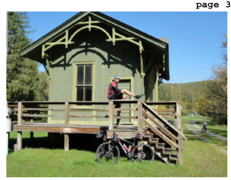
Taking a break after raiding the apple trees at Clover Lick.