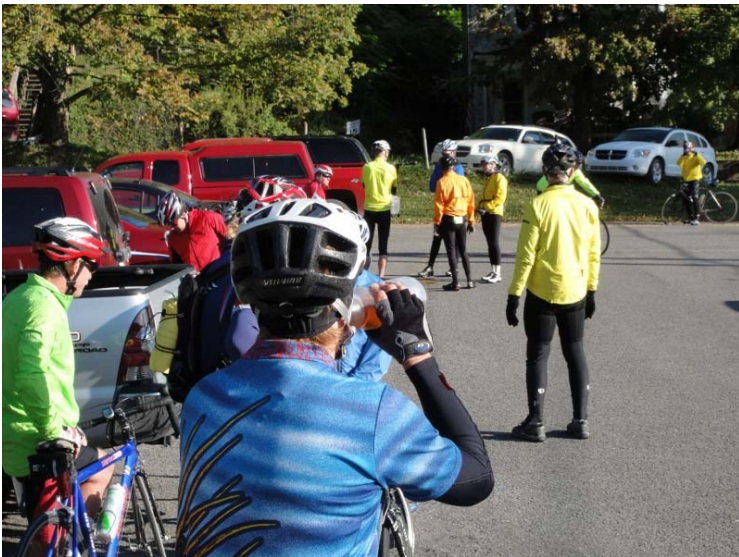
at the Salem start

DUES ARE DUE with no increase in rates: $10 for individuals, $12.50 for families. A flier is included with this newsletter unless we already have your 2013 dues. It is also posted on our web site: crcyclists.org . We hope to see your renewal, even as we are looking for new members, so tell your cycling friends about us.