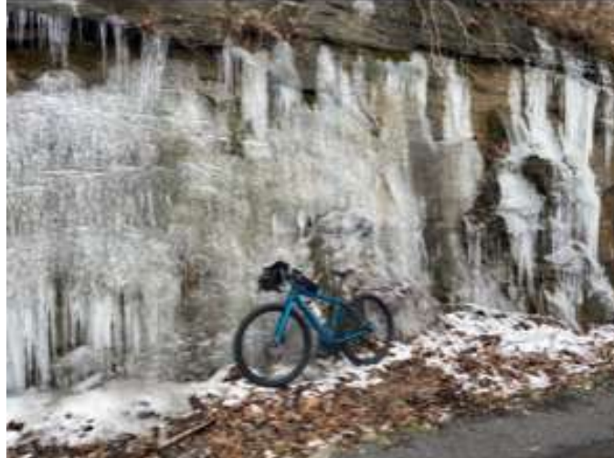
Figure 5 Ice on the Mon, by Phil Slates

Mike Hawranick rode 17 miles on the abandoned turnpike and tunnel outside of Breezewood, PA, on February 15. There is a 13 mile stretch of abandoned turnpike with 2 tunnels. This property has been turned over to an organization called Pike2Bike in the year 2000, but no improvements have occurred yet.