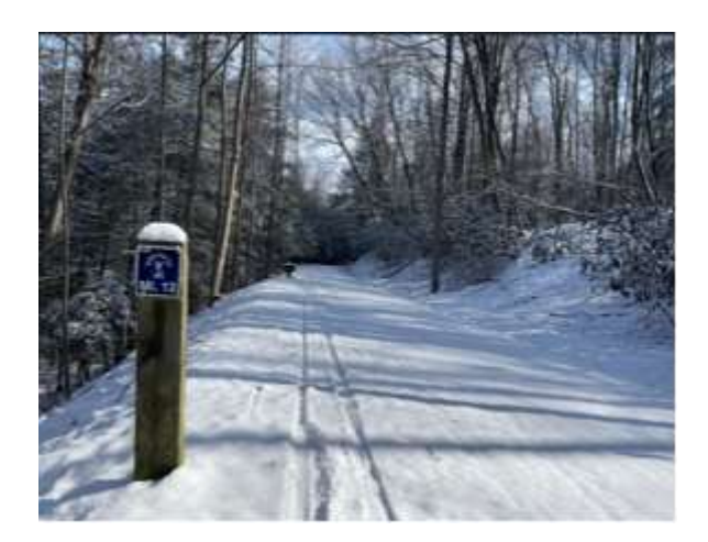
Figure 1 Decker's Snow, Karl D.