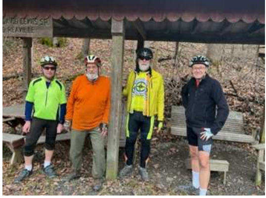
Figure 3 New Year's Day ride, 2023