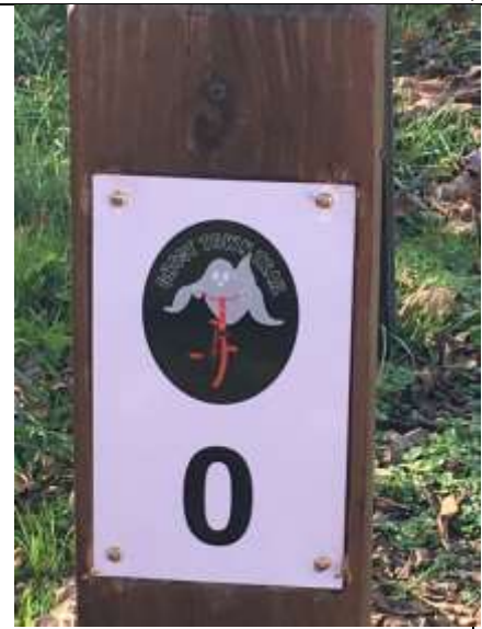
Figure 4 Starting the Ghost Town Ride

Last year, we rode the Greenbrier River trail, the GAP Trail into Pittsburgh, the Pine Valley Trail, and the Panhandle Trail. The year before it was the Allegheny River Trail and the Ghost Town Trail. There are so many trails to ride, so any suggestions for any bike packing trips would be appreciated. Let any of the officers know of any suggestions you may have for any day trips and overnight trips. What some club members did over the (mild) winter: