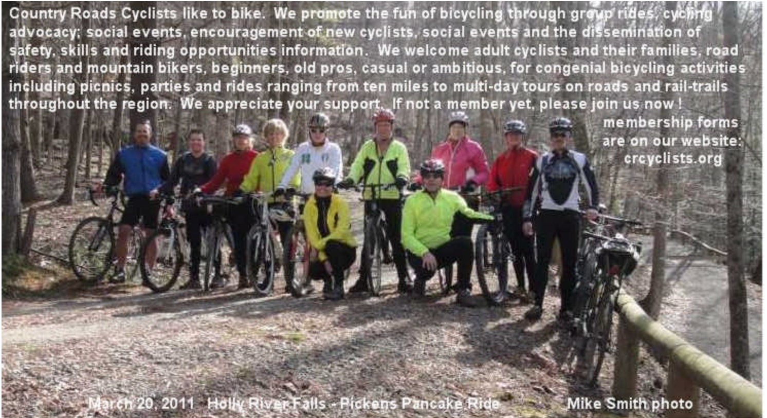
March 20, 2011 Holly River Falls - Pickens Pancake Ride

membership forms are on our website: crcyclists.org