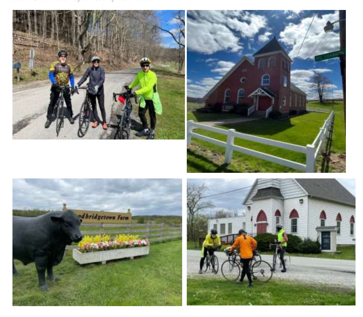
Table 1 Greene and Fayette County Adventures

Fayette and Greene County Rides, Mon River Trail Clean Up, sponsored by MRTC: