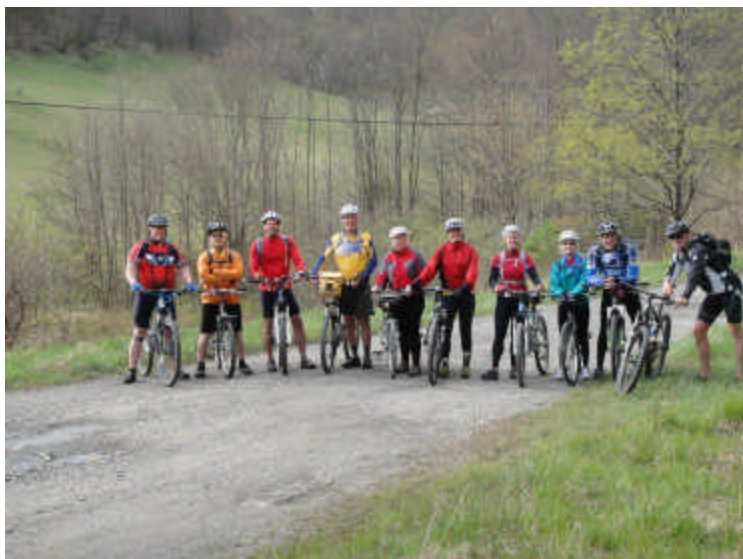
LVBC & CRC ready for the Blackwater Canyon rail-trail