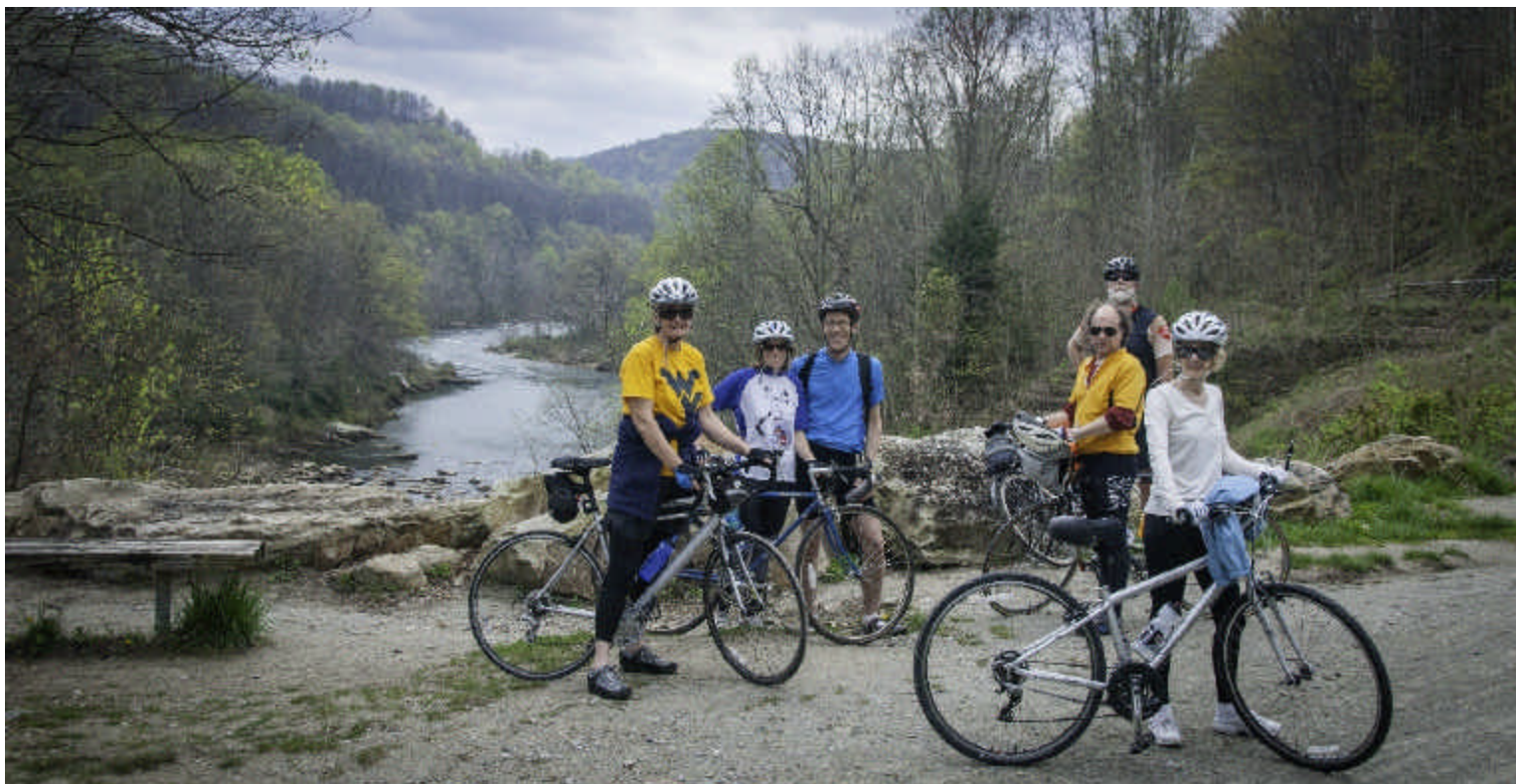
Burner Run Overlook on the Great Allegheny Passage, April 15, 2012