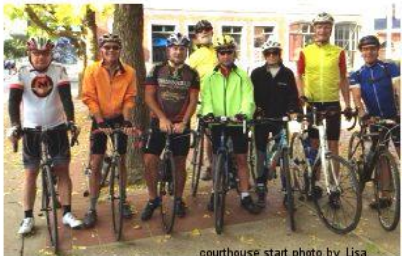
courthouse start