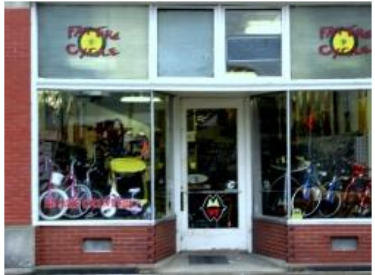
Fat TireCycle at 33 East Main Street in Buckhannon