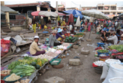
Sisophon, Cambodia street market