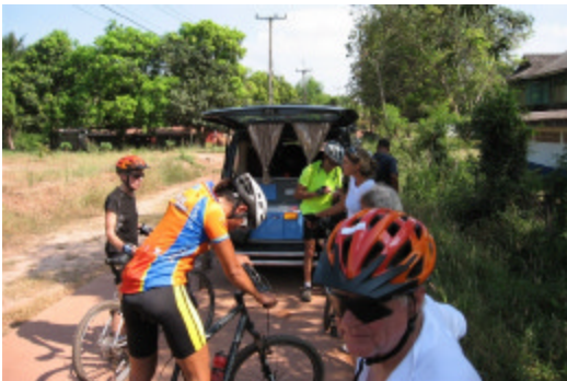
ruts and bumps road, sag van delivers