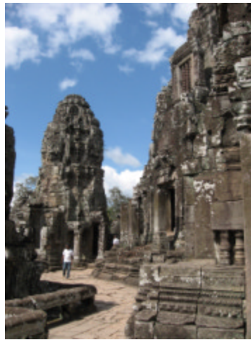
Angkor Wat temples