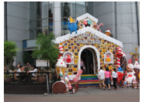
Candy Land at Saigon Centre