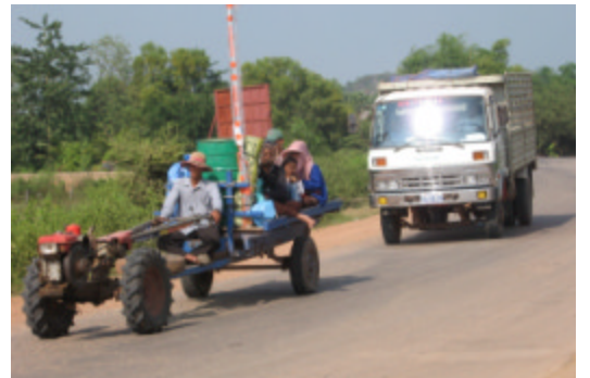
like a Gravelly tractor with flatbed