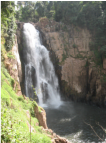
waterfall, Khao Yai Nat. Park