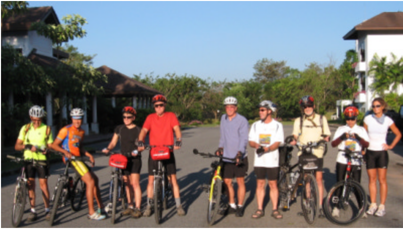
Ready for a good day in Thailand