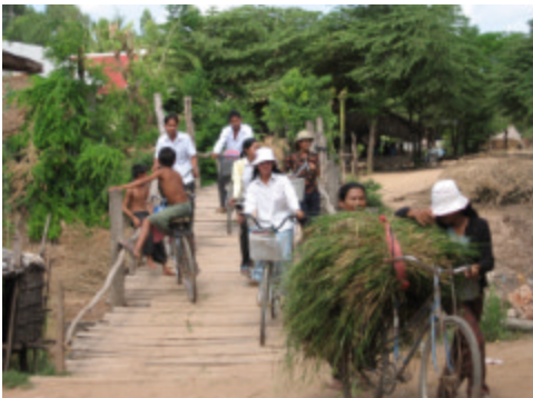
crowded bridge, grass man with bike