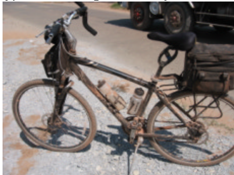
Bruce's hybrid, broke and dirty