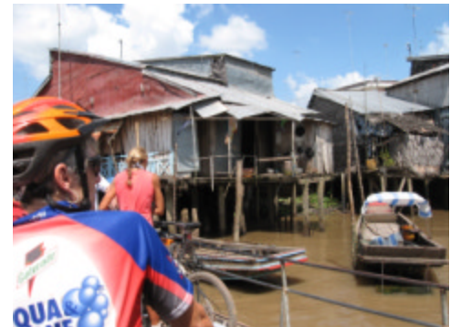
some stilted Vietnamese river homes