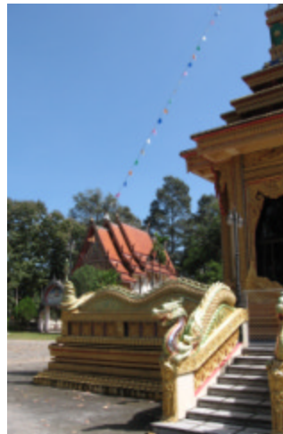
a temple dragon railing