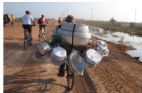
pan man on bike on another dirt road