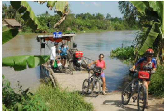
a typical Mekong delta ferry