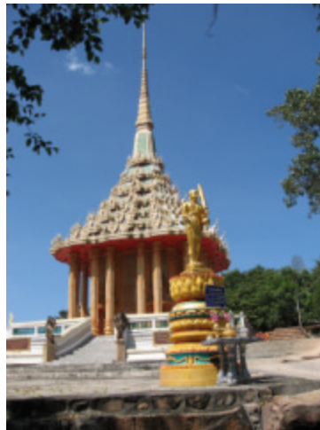
small Thai temple