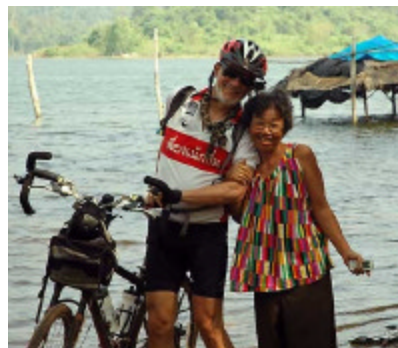
"The Cyclist's Friend" jersey