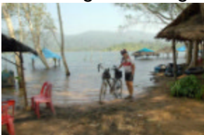
online at crcyclists.com, you can enlarge these to 500%