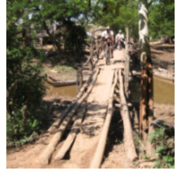
love those narrow bridges