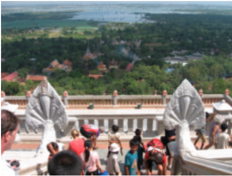
Oodong Mountain temple vista