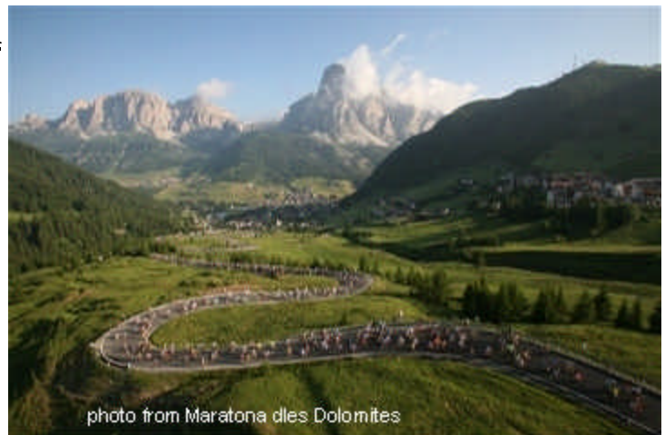
photo from Maratona dies Dolomites